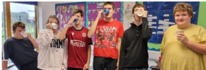
Testing the hot chocolate cones